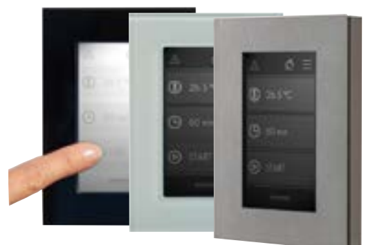
The external display in three versions

The cleverly designed magnetic frame construction, however, also allows steam bath builders to individualize the fitting with a material of the customer's liking.