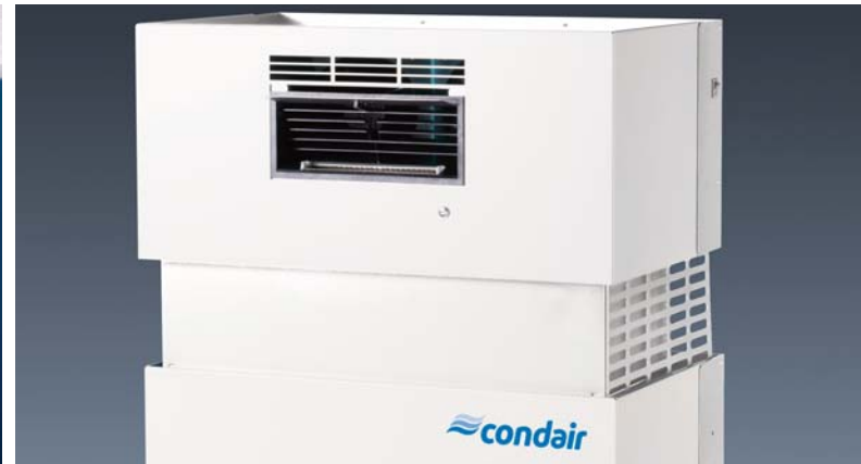
Condair CP3 steam humidifier