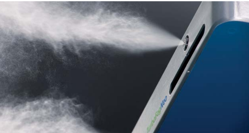
Draabe TurboFogNeo high pressure humidifier