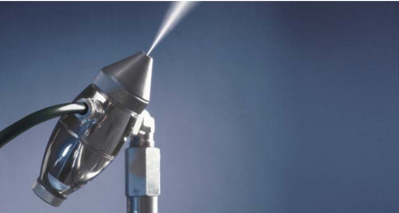
JetSpray compressed air & water humidifier