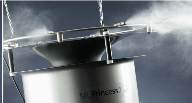
ML Princess high pressure humidifier